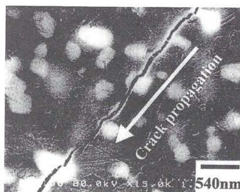
Fig. 2. SEM micrograph of crack propagation in CorZr25 composite sintered at 1440°C/2h.

The SEM micrograph (Fig. 3(b)) of CorZr25 shows an essentially pore-free microstructure and a uniform spatial distribution of the dispersed ZrO 2 particles, with little agglomeration between them, and cordierite matrix grains size are smaller than that of CorZr0 (Fig. 3(a)) specimen. It is believed that ZrO 2 dispersions limit the cordierite grains growth by pinning and prohibiting the grain boundary movement. ZrO 2 parti-